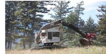
Figure 2. Cable System