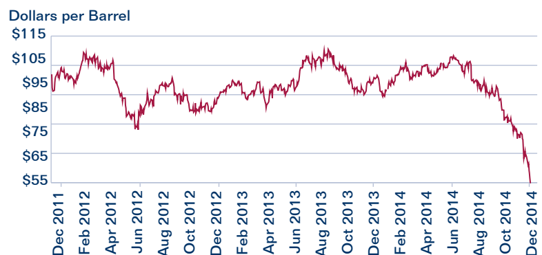
Figure 1 West Texas Intermediate Oil Prices