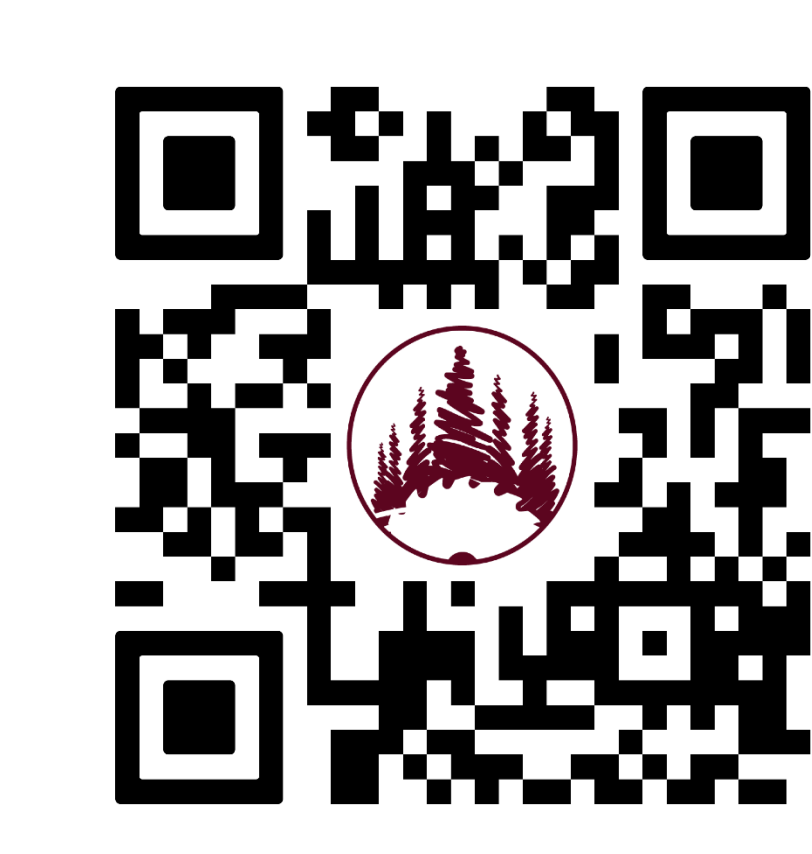
Scan for an electronic version of this poster