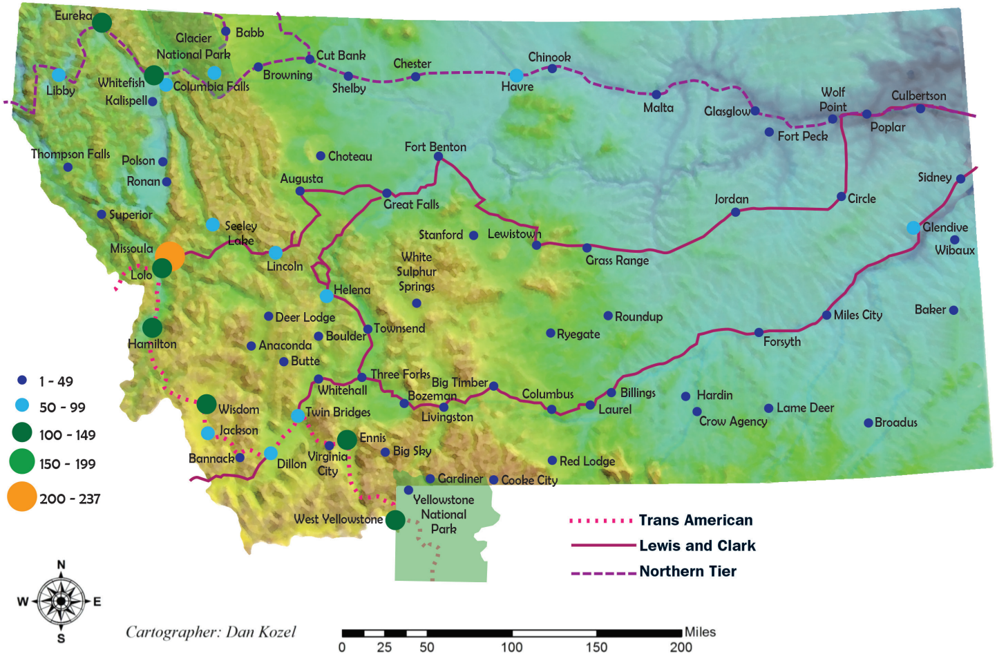
Figure 2 Overnight Location of Touring Cyclists in Montana