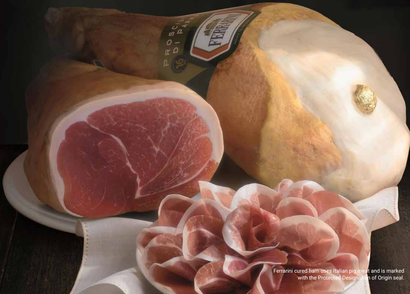
Ferrarini cured ham uses Italian pig meat and is marked with the Protected Designation of Origin seal.

ingredients and value-added processes in the production of products like Parmesan cheese, authentic Genoese pesto and coffee.