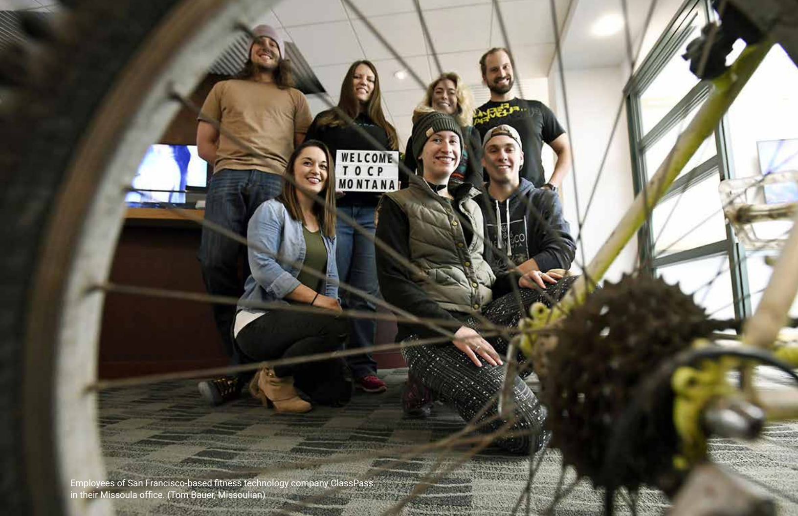
Employees of San Francisco-based fitness technology company ClassPass in their Missoula office.

more than 1,200 new jobs in 2018, an 18.5 percent increase over 2017, and raise wages by 5 percent this year, significantly faster than the 1.6 percent growth rate of all Montana employers.