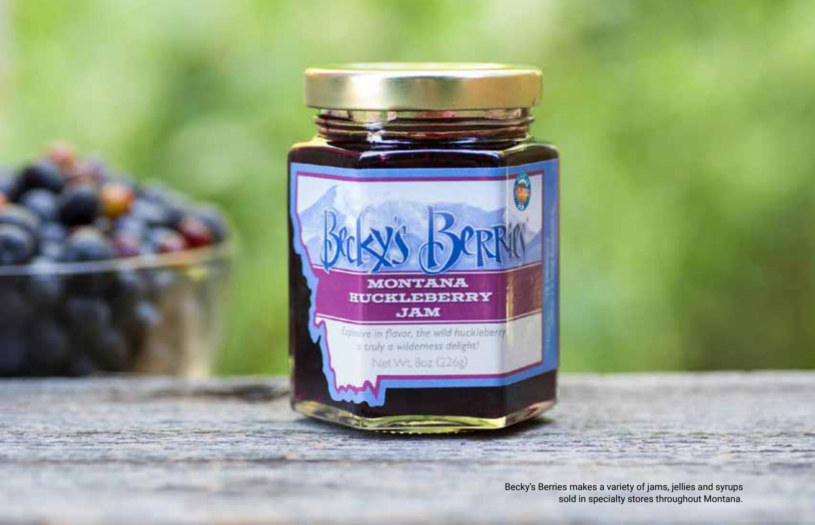
Becky's Berries makes a variety of jams, jellies and syrups sold in specialty stores throughout Montana.

It goes without saying that the Made in Montana mark has enjoyed its share of success. A 2016 survey on traveler spending in the state indicated that Montana-made product purchases ranked seventh among nonresident expenditures, with tourists spending on average $10.20 per day. The survey provides a breakdown of goods purchased by tourists and not surprisingly foods, such as the huckleberry jams and cordials, are at the top the list (Table 1).